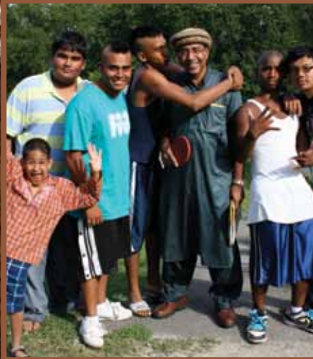
New York Bangla Community